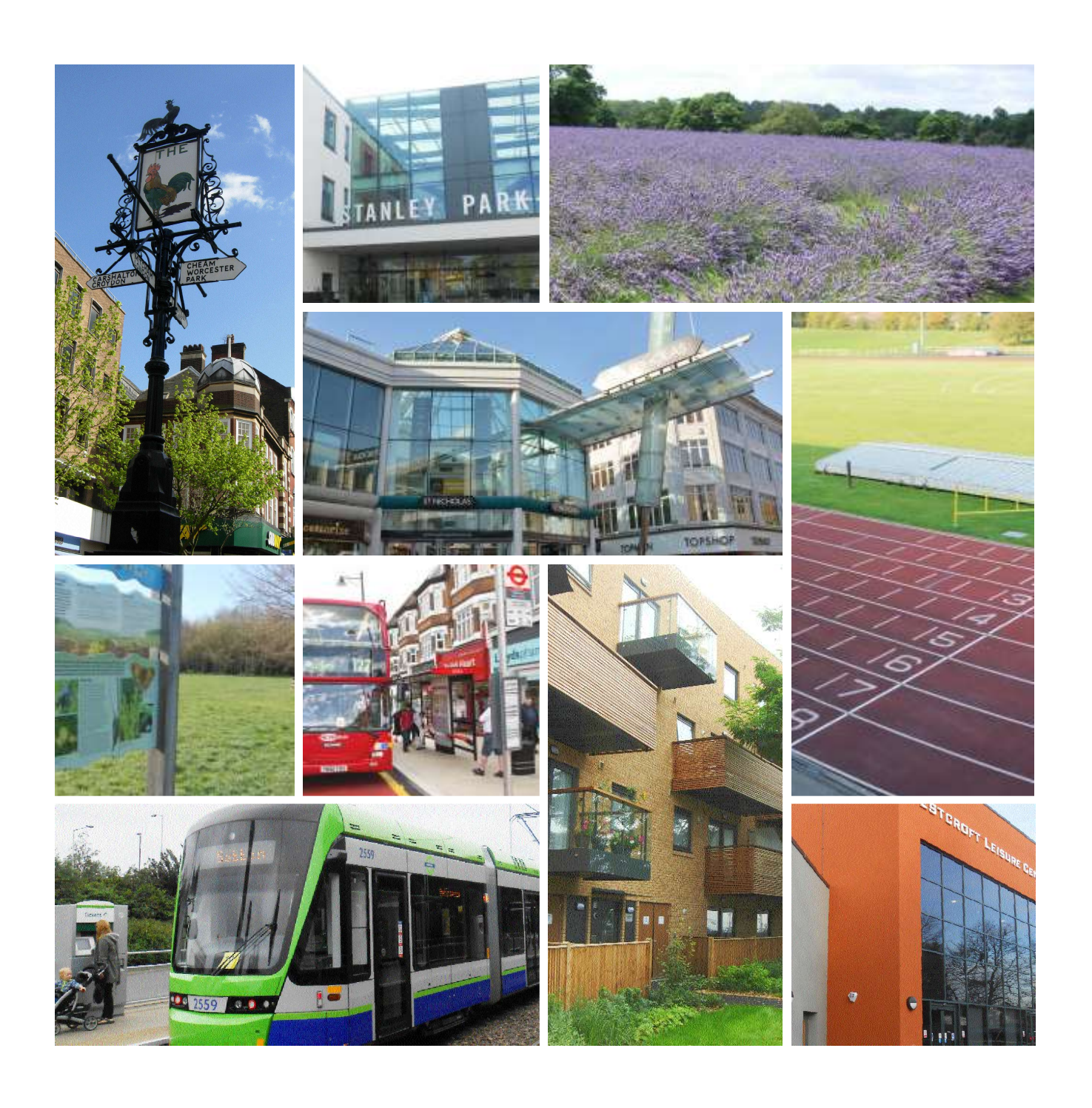
London Borough of Sutton Local Plan